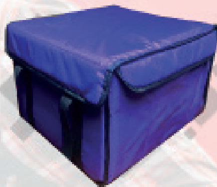
COURIER COMPANY BAG DESIGN