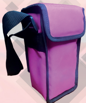
COURIER POS BAG DESIGN