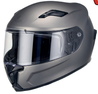
SWAY 820 MAT GREY