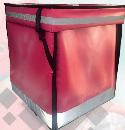
COURIER COMPANY BAG DESIGN