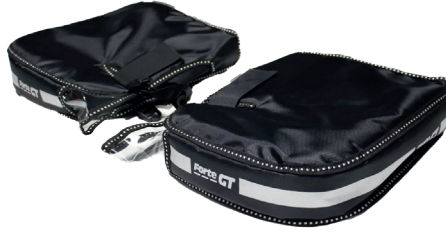
TEX 293 IMPERTEX SCOOTER HAND WIND PROTECTION