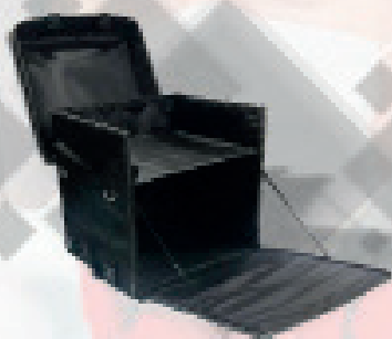
COURIER COMPANY BAG DESIGN