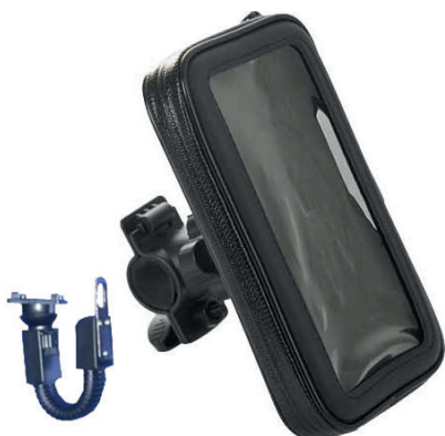
TEX 2084 PHONE HOLDER MIRROR / HANDLEBAR