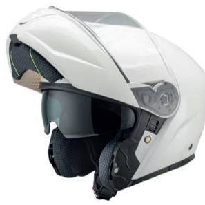
SWAY 917 GLOSS WHITE