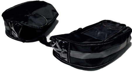
TEX 293 UCZ İMPERTEX SCOOTER HAND WIND PROTECTION