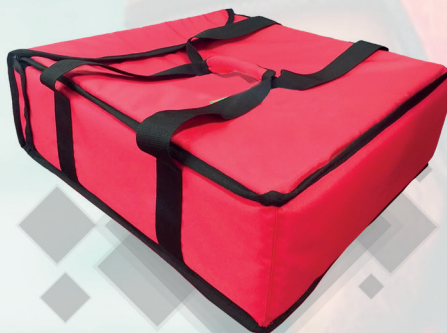
COURIER PIZZA BAG DESIGN