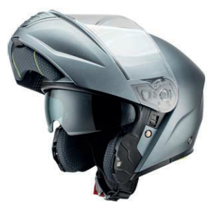
SWAY 917 MAT GREY