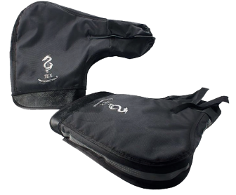
TEX 293 İMPERTEX GEAR HAND WIND PROTECTION