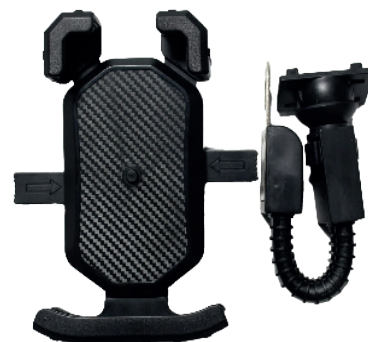
TEX LX-4107 PHONE HOLDER MIRROR