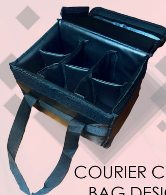
COURIER COFFE BAG DESIGN