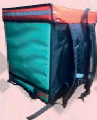
COURIER COMPANY BAG DESIGN