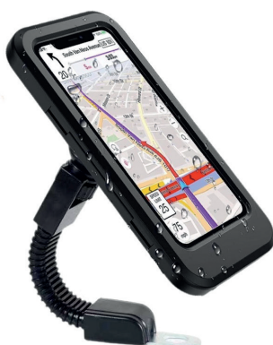
TEX 2084 - 15 PHONE HOLDER MIRROR