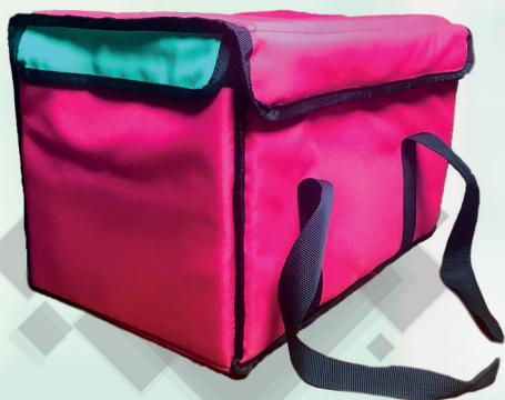
COURIER COMPANY BAG DESIGN