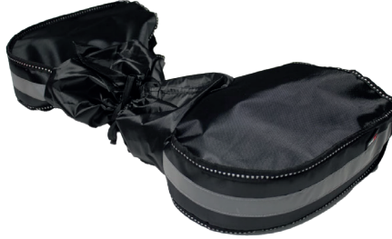
TEX 293 UCZ İMPERTEX GEAR HAND WIND PROTECTION