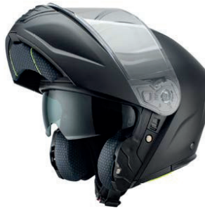
SWAY 917 MAT BLACK