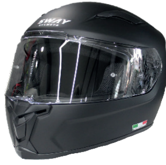
SWAY 820 MAT BLACK