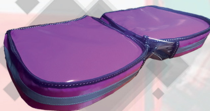
COURIER HAND GUARD DESIGN