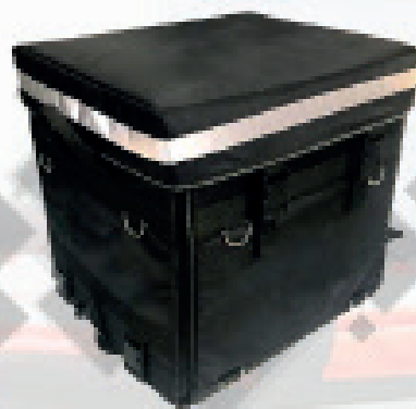
COURIER COMPANY BAG DESIGN