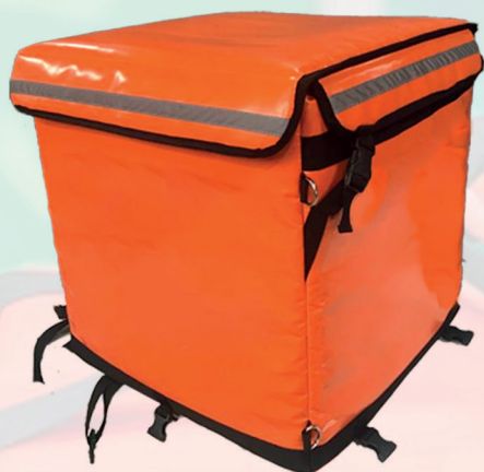
COURIER COMPANY BAG DESIGN