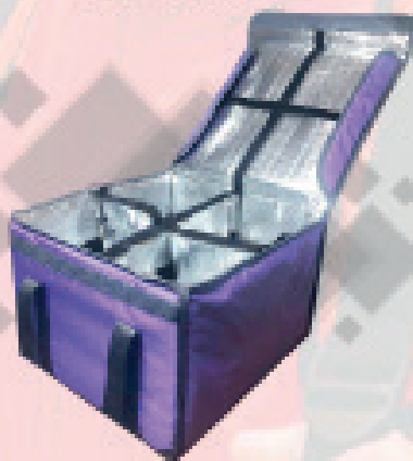
COURIER COMPANY BAG DESIGN