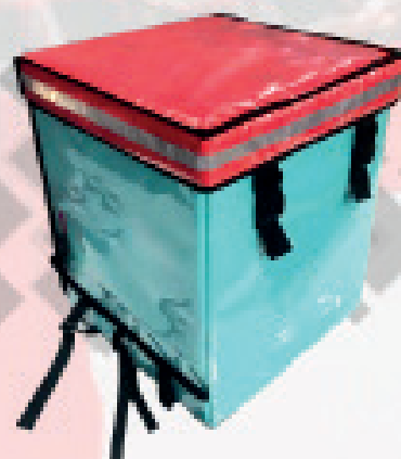
COURIER COMPANY BAG DESIGN

BESIDES MANUFACTURING MOTORCYCLE & BICYCLE GEARS AND GARMENTS, TEX MOTOR IS ALSO MAIN SUPPLIER AND MANUFACTURER OF FOOD DELIVERY CLOTHING, ACCESSORIES AND BAGS FOR MANY GLOBAL COMPANIES.