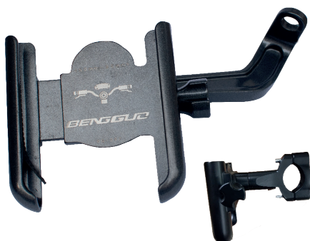
TEX 2084-9 PHONE HOLDER MIRROR / HANDLEBAR