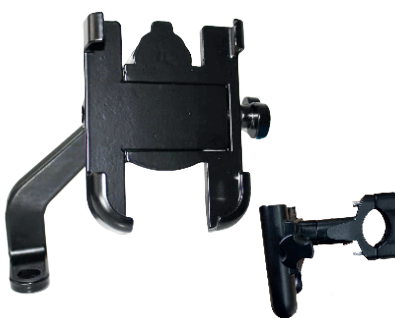
TEX 2084-9 UCZ PHONE HOLDER MIRROR / HANDLEBAR